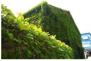
Yoshino-Gawa, Jou-Kura covered with Japanese Ivy

Yoshino-Gawa, Jou-Kura Jou-Kura means in Japanese, "Always using for warehouse". Now it is used as a product shipment field with