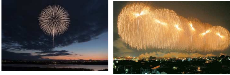
Nagaoka City Hanabi

As I will explain later, Nagaoka city had been devastated one more time about 150 years ago, although it was the civil war.